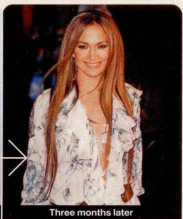
Three months later