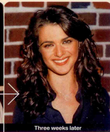
Three weeks later