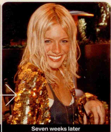
Seven weeks later