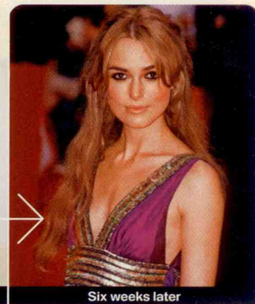
Six weeks later