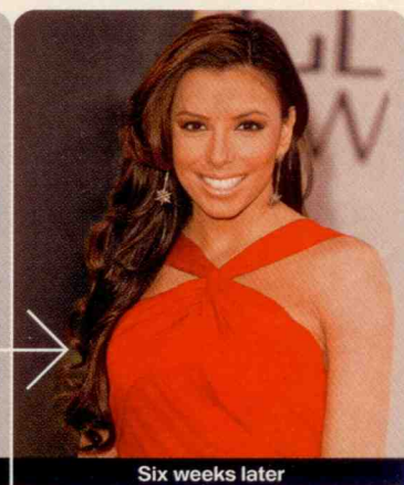
Six weeks later